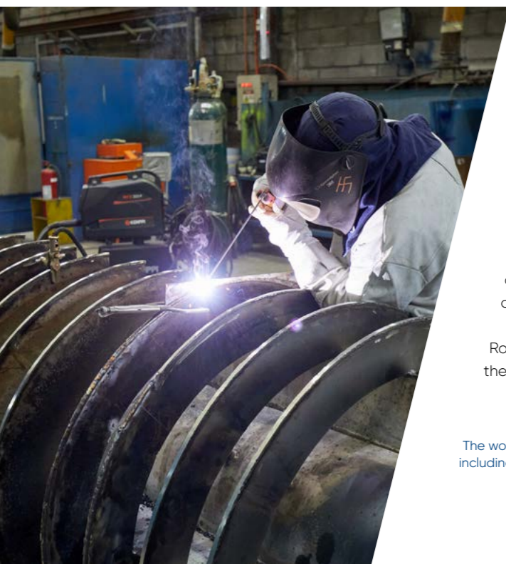
The workshop has the very latest in engineering technology, including CNC machines, milling, grinding, and welding.